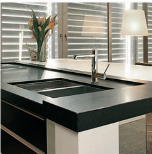
Simplifies kitchen design